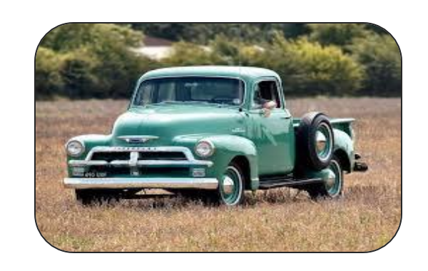
↑Factory Made Complete Vehicles↑ ↓Kit Vehicles↓