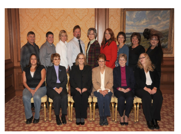
The Wyoming Fuel Tax Team

The inaugural edition of the Wyoming Fuel Tax News has a dual purpose as we believe there will be some value in letting our readers know a