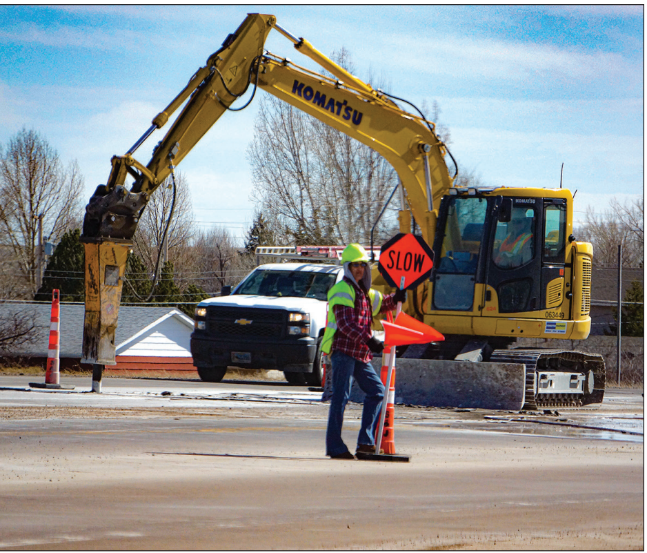
Keeping speeds lower through work zones and putting down distractions protect construction workers, as well as drivers.

When driving through a work zone, motorists can encounter changing traffic patterns and increased activities from crews. For example, if crews are working on one lane of a two-lane