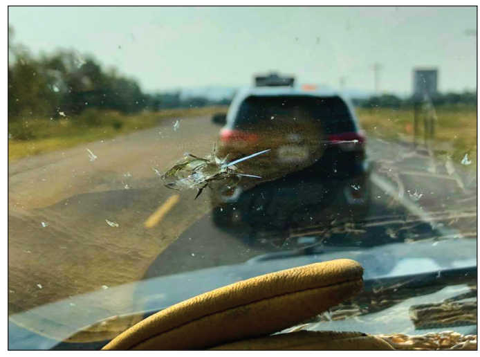
Fresh chip sealing can create the risk of flying rock at unsuspecting drivers and windshields.

During the chip-sealing process, from the time oil and gravel is placed on the road to when excess rock is swept away (often