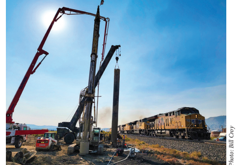
WYDOT is in the process of drilling 48-foot shafts at the project location.

The scope of the project includes replacing an existing bridge over the interstate to provide a higher vertical clearance, constructing eastbound and westbound ramps with continuous acceleration/deceleration lanes to Dewar Drive and building