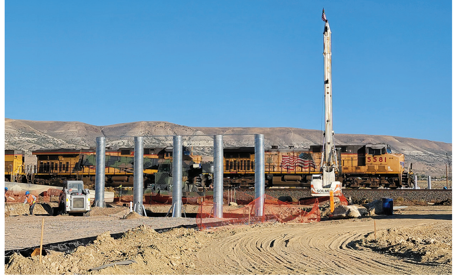
Work being done on a project just east of Rock Springs as a Union Pacific train passes by.