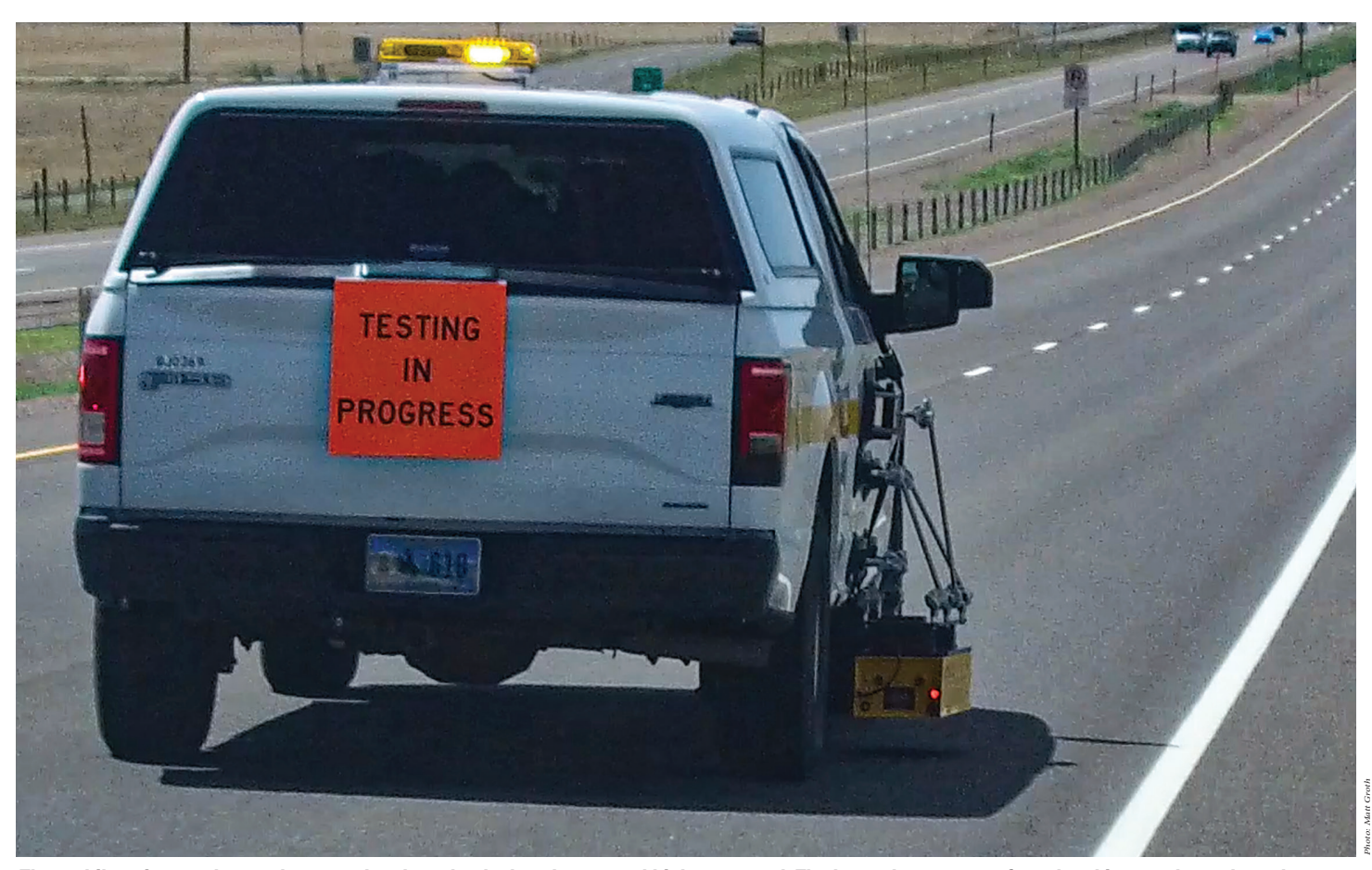
The mobile unit stays low to the ground and can be deployed at normal highway speed. The laser shoots out 20 feet ahead is not a hazard to other vehicles, although the operation does tend to draw curiosity from people passing by.