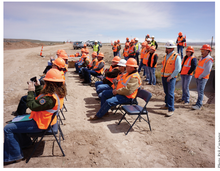
Nearly 40 stakeholders look on as ground was broken on the Dry Piney project which is located on US 189 in southwest Wyoming.

The project is scheduled to be completed in late 2023.