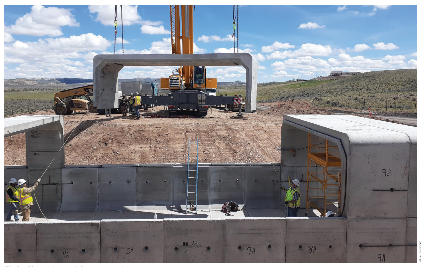
The Dry Piney underpass being constructed.