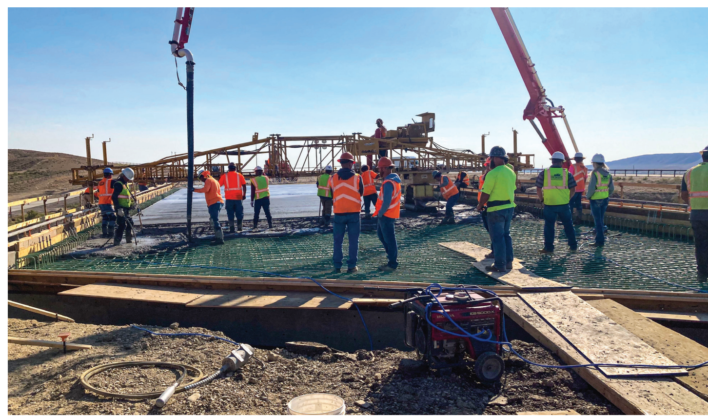
A crew with IHC Scott work on pouring concrete for a bridge deck at the Baxter Interchange on I-80 east of Rock Springs. The contractor and WYDOT were awarded an Excellence in Concrete Paving award this year by the Colorado/Wyoming chapter of the American Concrete Paving Association.